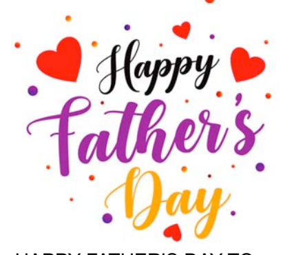
HAPPY FATHER'S DAY TO ALL OUR PARISHIONERS WHO ARE FATHERS

All parishioners are welcome to join with others for a cuppa in The Shed at Willunga after Mass today (Sunday 3 August).